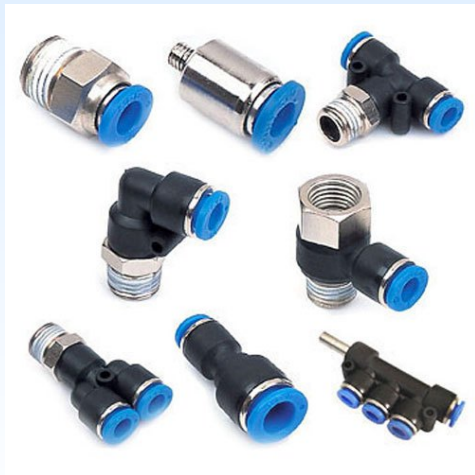
Push in Fittings